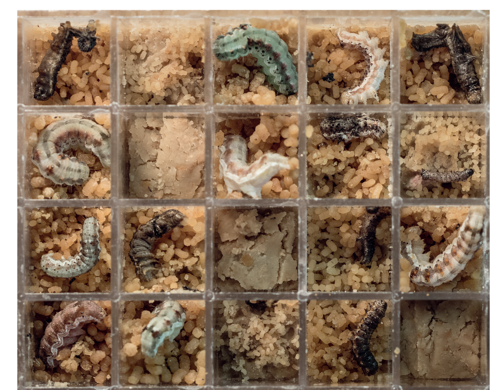
The activity and quality of every batch is tested before release