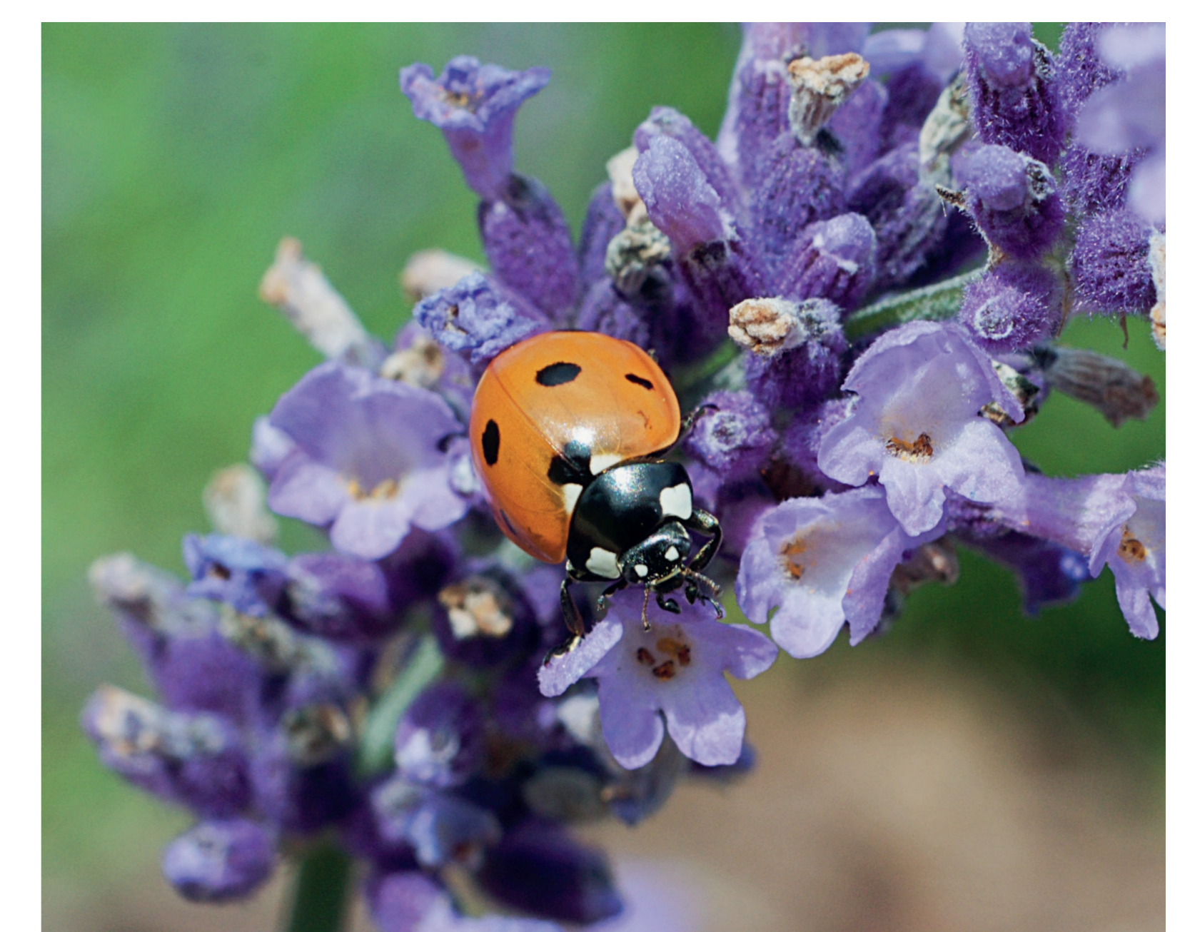
Baculoviruses are highly compatible with all beneficials

*Toxicity strain/product dependent Andermatt Biocontrol Suisse – content has been compiled to the best of the company's knowledge – no guarantee for the accuracy and completeness can be given